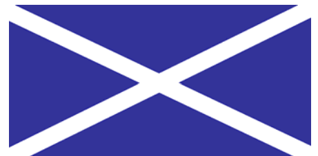
Brotherhood Of Saint Andrew's Flag

sanctuary for our Rector and Alter Guild to use. The Brotherhood worked like a true team, getting a much needed "Chore of the Church" out of the way. What is next, only time will tell.